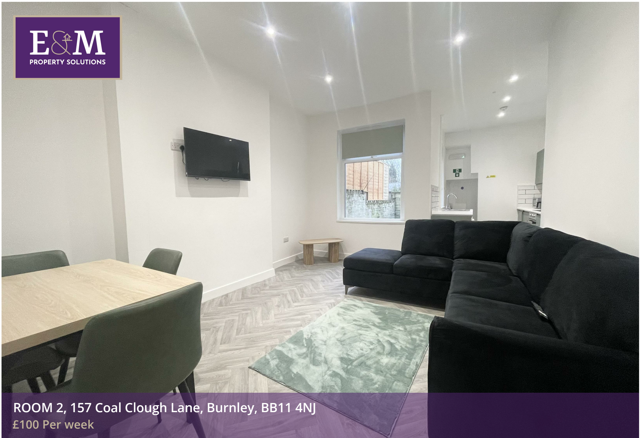
ROOM 2, 157 Coal Clough Lane, Burnley, BB11 4NJ £100 Per week